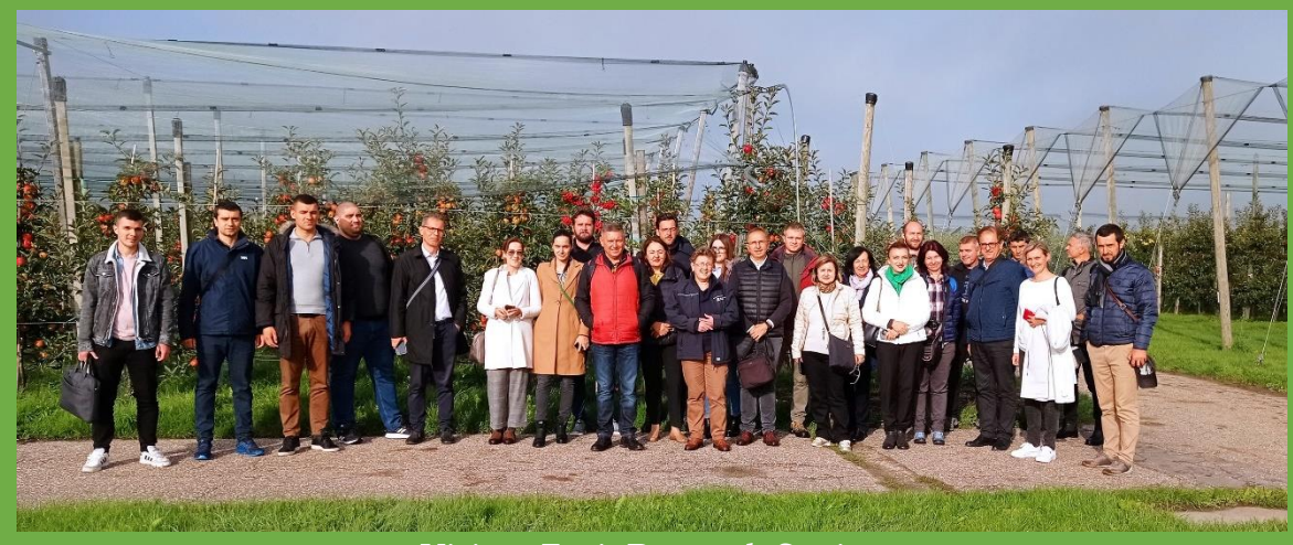
Visit to Fruit Research Station

Of special interest was the camera for measuring the quality of the fruits after harvest, as well as the development of a robot for mechanized pruning and harvesting. The use of solar panels in the production of pears, as well as the production of apples in a fully automatized greenhouse, were of particular interest to the participants.